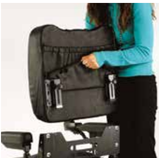
Back-Off easily removes back of mobility device to fit into shorter vehicle openings.