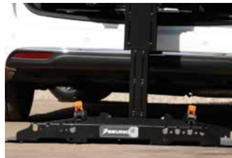
Belt kit* includes two retractable securement straps for added peace of mind. *Required in some vehicles