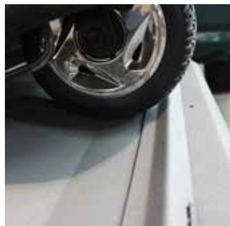
Wheel chock kit required for FWD powerchairs.