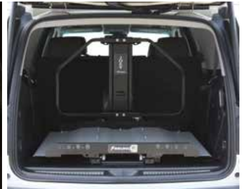
Industry-exclusive safety barrier. Protected by US Utility Patent No. 403.615