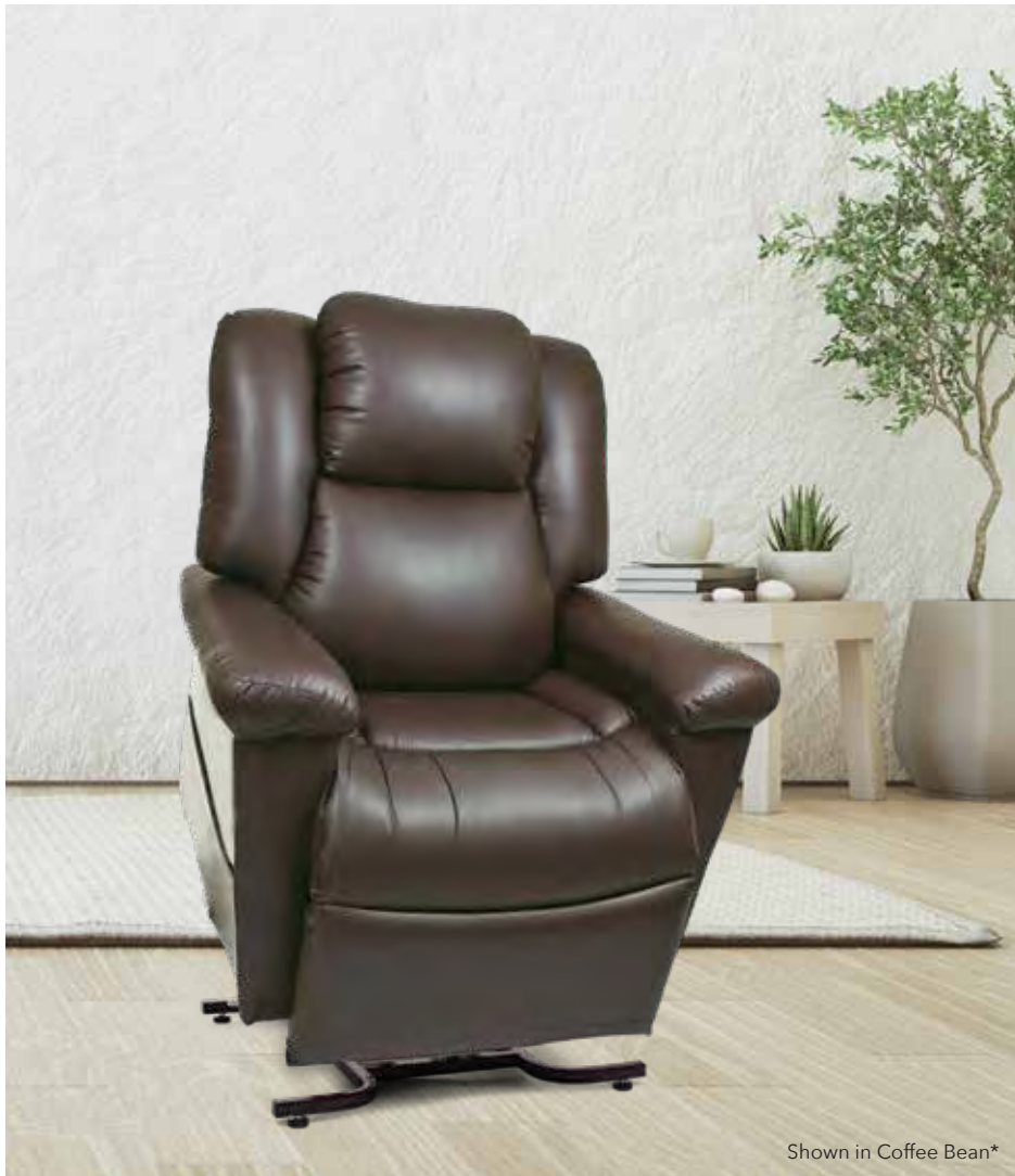
Shown in Coffee Bean*