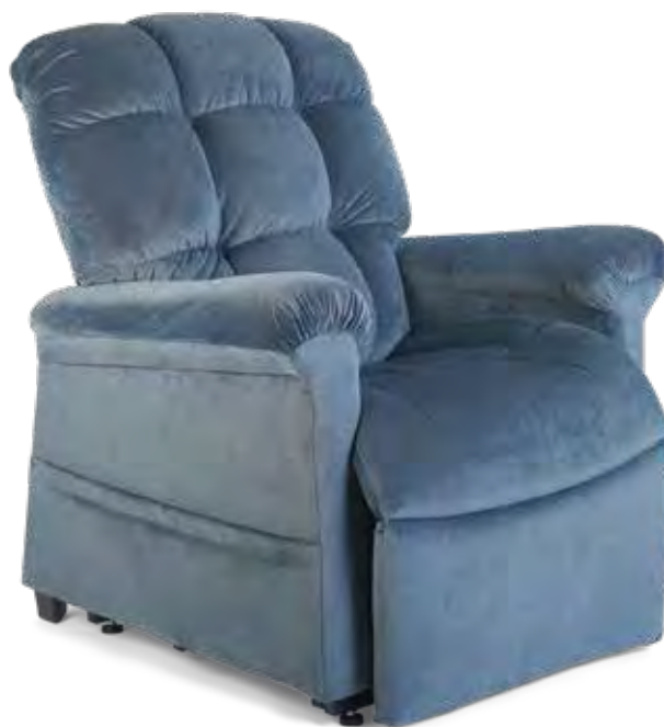
Shown in Calypso

Upgrade with Deluxe Therapeutic Heat & Massage!