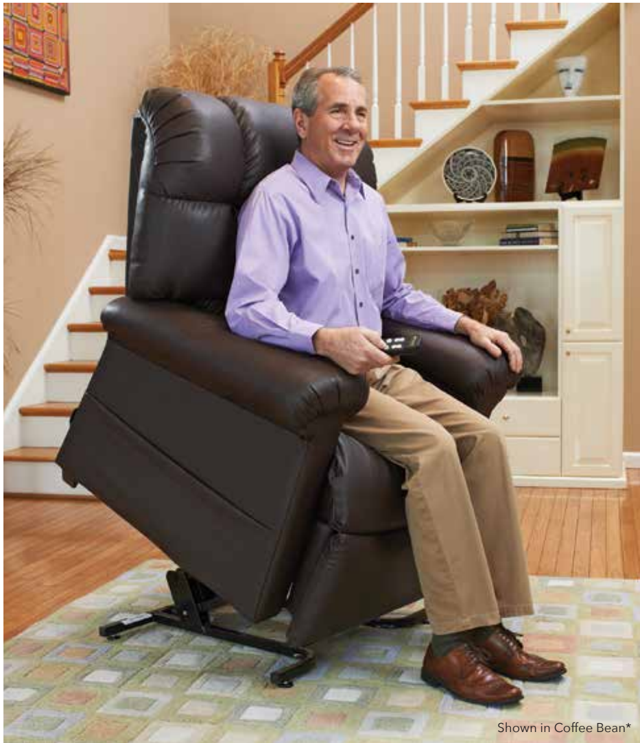
Shown in Coffee Bean*