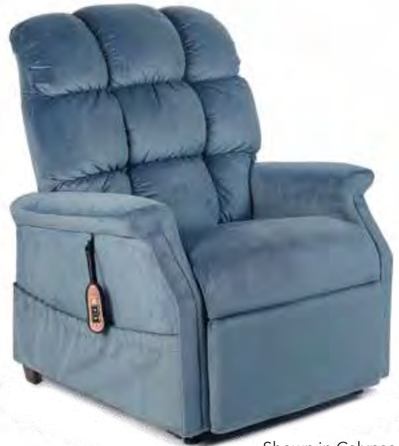
Shown in Calypso

Upgrade with Deluxe Therapeutic Heat & Massage!