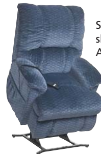
Space Saver shown in Atlantic fabric

Batteries not included. Safety System is designed to bring chair from recline to seated position in the event of a power outage.