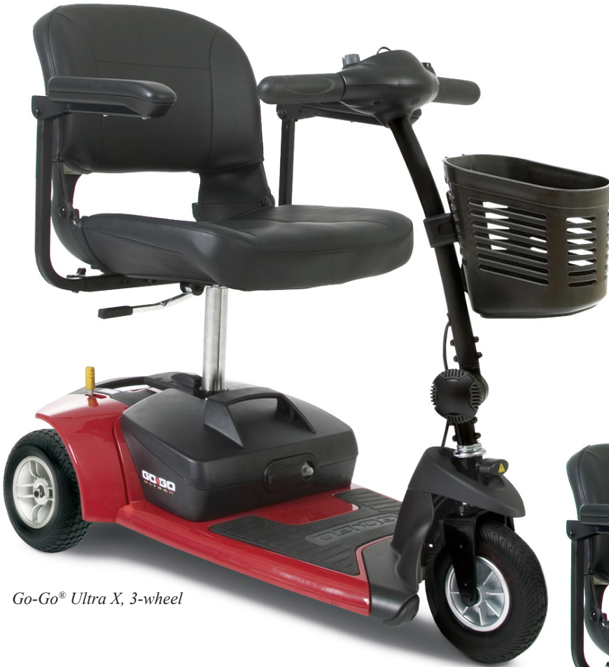
Go-Go ® Ultra X, 3-wheel

The Go-Go ® Ultra X is loaded with design features like one hand Feather-touch disassembly and a convenient drop-in battery box that makes transport and travel worry free. The Go-Go ® Ultra X delivers these features and more, along with the performance you expect from the first name in travel mobility, making it the ultimate travel scooter value.