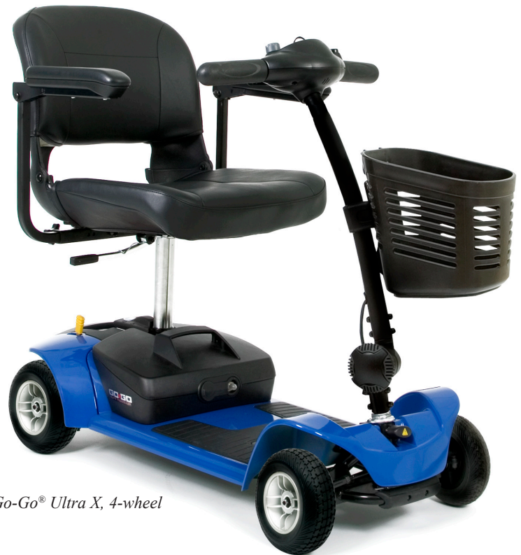
Go-Go ® Ultra X, 4-wheel