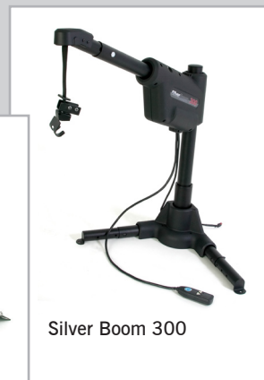
Silver Boom 300

NOTE: All specifications subject to change without notice.