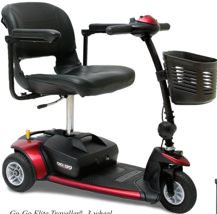
Go-Go Elite Traveller® , 3-wheel

The Go-Go Elite Traveller®'s compact design allows it to easily maneuver in tight spaces while providing stable outdoor performance. Take the guesswork out of travel with simple, one hand Feather-touch disassembly. Go where you want to go, easily, with the Go-Go Elite Traveller.