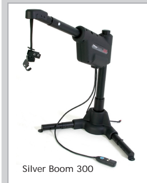
Silver Boom 300