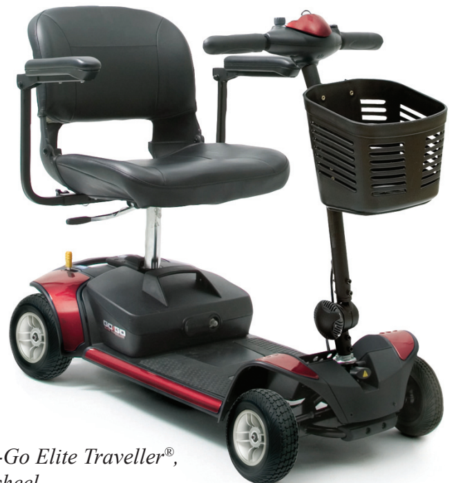
Go-Go Elite Traveller® , 4-wheel